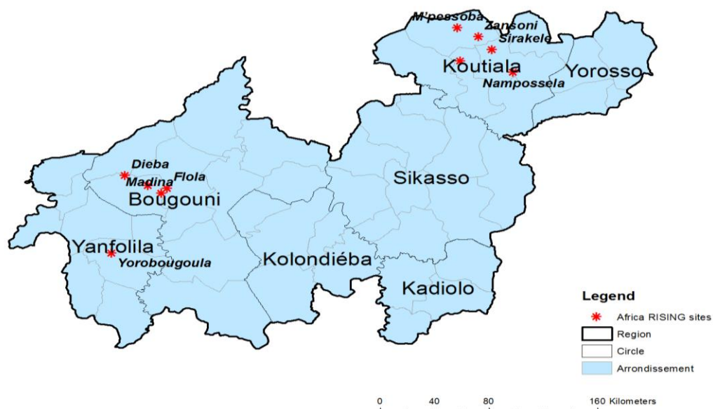
Figure 2. Africa RISING intervention villages in Mali.